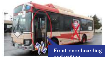
Front-door boarding and exiting