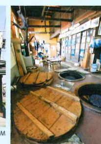
Kawasaki Dye Works

63 Kamenoko-machi, Hirosaki City Workshop tour: ¥200 (9:00 AM to 5:00 PM; closes at 4:00 PM November to March)