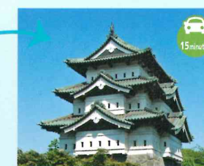
Hirosaki Park (Hirosaki Castle)

An imposing structure with layered gables, Tohoku's only existing castle tower