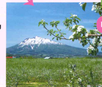
Hirosaki City Apple Park

8-1 Kamishirogane-cho, Hirosaki City ¥310 Children: ¥100 (Mid-April to November 23; 9:00 AM to 4:30 PM; Open temporarily on certain days in winter)