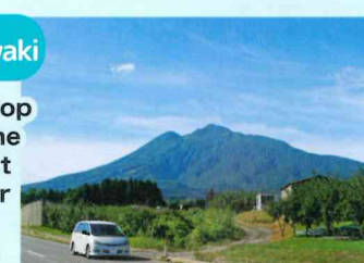
Surprising sweetness! Dake Kimi

Take Konan Bus from JR Hirosaki Station toward Karekitai (50 minutes), transfer to a shuttle bus at Dake Onsen Hot Springs (30 minutes), then get off at Mt. Iwaki Station 8 (lift loading area)