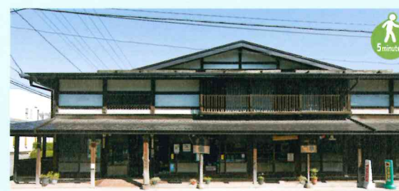
Ishiba Family Residence

125 Shimizutomi Terasawa, Hirosaki City Entrance: Free of charge (Fee for apple harvesting; open every day 9:00 AM to 5:00 PM)